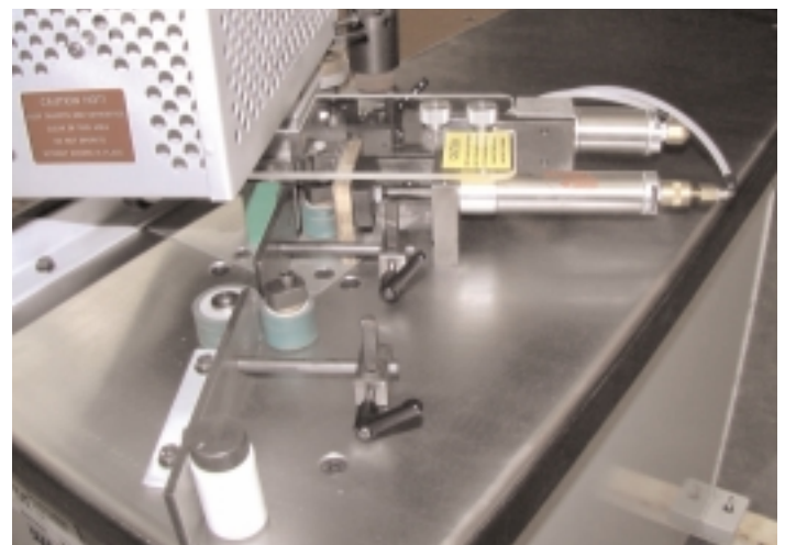
Glue Applicator & Pressure Roller